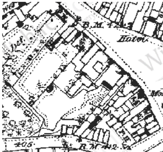
1st Edition OS late 19 th Century

This building still falls within the curtilage of the listed building and appears to pre date 1948 and was used as an extension of the printing and newspaper production. It is therefore considered to be a designated heritage asset. Its western wall was originally the garden wall between this site and its neighbour No 16 and is therefore considered to be curtilage listed.