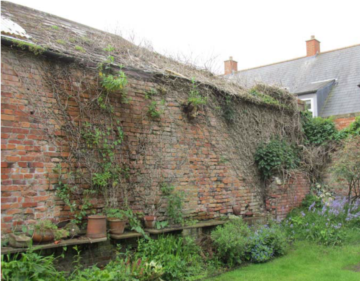
Photograph showing condition of garden wall

The main structure of the extension holds little architectural or historic interest. The boundary wall is of some significance and value. It is considered that the demolition of the main structure is uncontentious and it is evident that due to its condition the garden/boundary wall is in need of substantial rebuilding. This work should be carried out by re using the existing bricks and a traditional lime mortar.