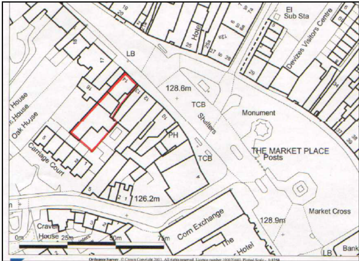
Site location plan

The building fronting the Market Place is a grade II listed early 19 th century building. The building immediately to the rear of the principal building was used as the print works to the Gazette and Herald Newspaper. This building is considered to be curtilage listed due to its association with the principal listed building.